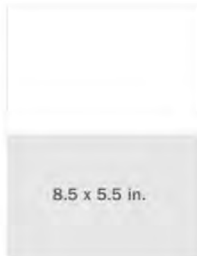
1/2 PAGE HORIZONTAL