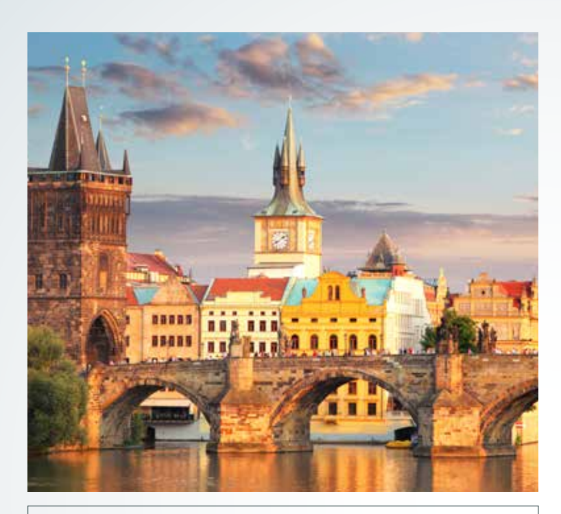
TOUR LODGING INFO: 7 Nights hotel accommodation on double occupancy basis + 1 Night onboard the flight

Visit three cultural capital cities of Central Europe on this fascinating week-long tour. Guests will explore the historic and picturesque cities of Prague, Vienna and Budapest, where remains of the past can be seen around every corner. With a half day guided tour in each city, comfortable 4 star hotels and time to explore at leisure, this is the perfect way to experience these three beautiful and unforgettable cities.